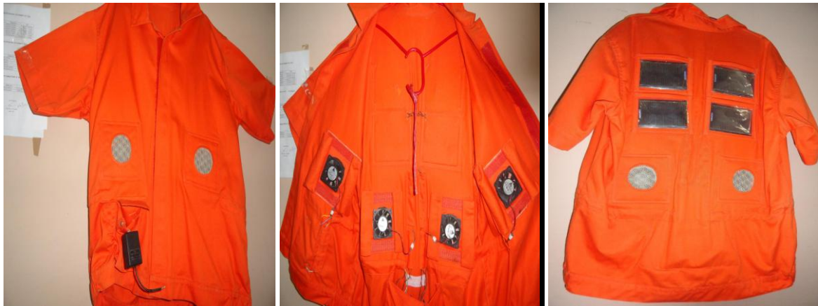
Fig. - 1