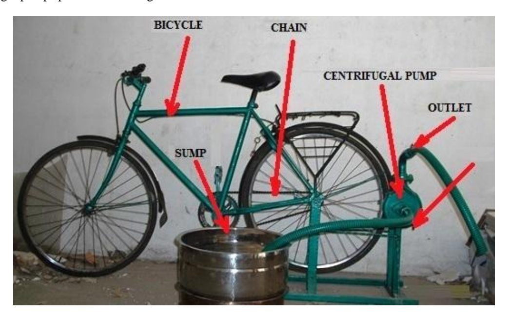
Figure 1: Pedal Powered Centrifugal Pump

The PPCP consists of mainly three parts, the first one is centrifugal pump, the second is the bicycle, and the third one is the stand. PPCP consists of a centrifugal pump operated by pedal power. The centrifugal pump is positioned on its stand in such a way that driven shaft of the centrifugal pump is butted to the bicycle wheel. By pedaling the bicycle, the bicycle wheel rotates, thereby rotating the centrifugal pump which in turns discharges water from the sump. Figure 1. shows the pedal powered centrifugal pump. Pedal powered centrifugal pump specifications are given in Table1.