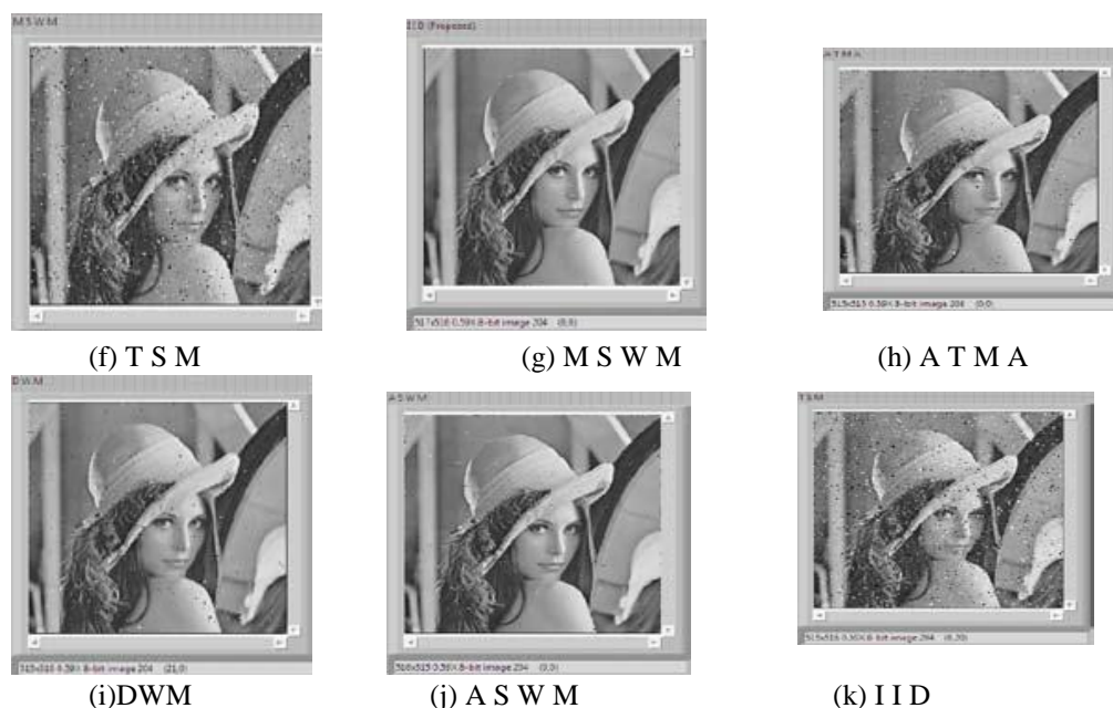
Fig. 2: (a to k), Restoration performance comparison on the “LENA” image degraded by 50% random-value impulsive noise.