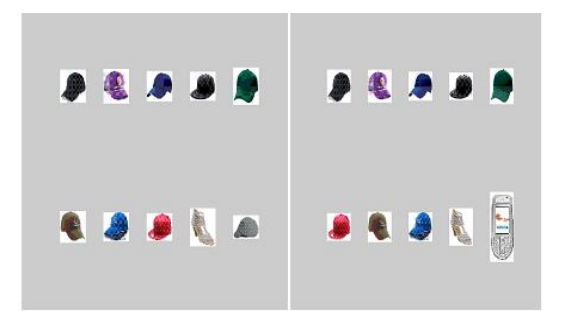
Fig. 2. Ten retrieval results of cosine on the left and Euclidean on the right

Figure 2 shows the images considered similar to the query image on the top left of the figure. It can be seen that the query image is part of the retrieved images, indicating that it belongs to the database. In the sample of retrieval in Figure 2, cosine has a 90% precision while Euclidean has a 80% precision.