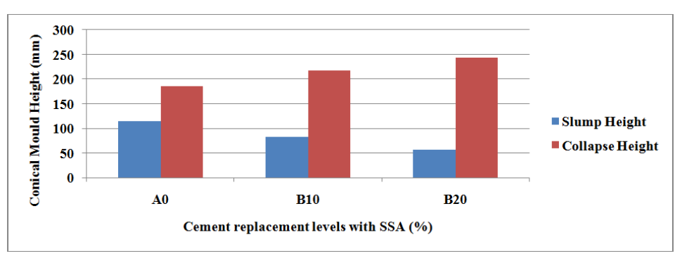
Figure 5: Slump behavior of SSA content in fresh concrete mix