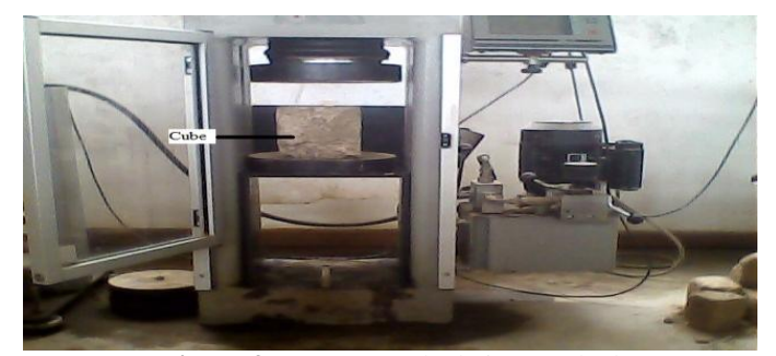
Figure 3: Concrete cube being crushed