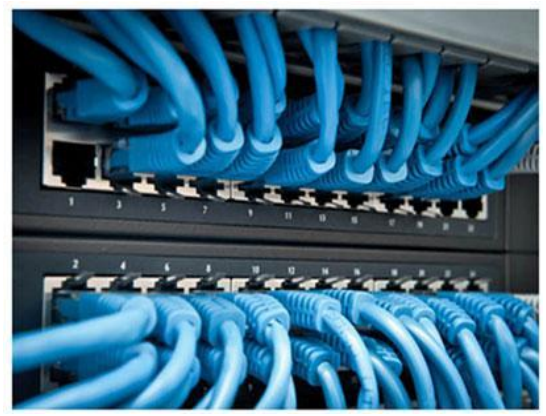
Fig.3. local area networks (WANs) Connection

Wi-Fi: Networking is playing vital role in current IT era where data distribution and access is critically important. As the use of communication between two or more entities increases the networking technologies need to be improved and refurbished over time. Similarly the transmission media, the heart of a network, has been changed with the time improving on the previous one. If you know a little bit about networking you surely have heard the term WIFI which is currently the dominant network technology. Wide spread of the WIFI technology made most of the offices, universities and buildings use the technology for establishment of local area networks (LANs).