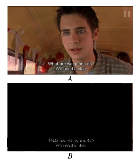
Fig 3. A) Original Video Frame. B) Transition Image

The thresholding value TH is empirically set to 0.2 or 0.3 (based on our observation) in consideration of the logarithmical change.