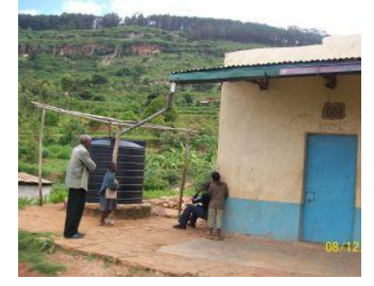
Figure 7; Plastic tank donated by Lion's club in Kalamba division