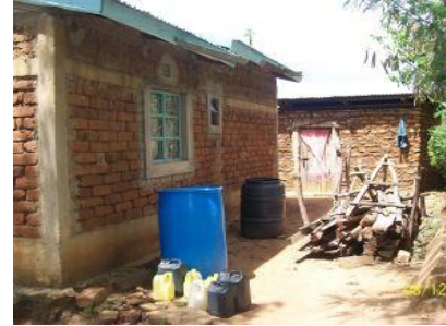
Figure 5: Jerrycan storage facilities in Tulimani division