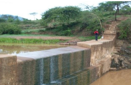
Figure 2: Syiuni subsurface dam

The Syiuni subsurface dam which was built in 2009 by the National Water Conservation and Pipeline Company (NWCPC) and provides water to several villages including Muusini, Miw'ani, Malindi, Makakoi and Kyandavi. Its capacity is about 1600m<sup>3</sup> and was constructed using local sand, boulders and ballast. Moreover, the dam has other components installed including a pump house and pumping unit, PVC pipeline system, a water tower and a water kiosk. This project provides water for domestic usage, livestock and construction purposes. To sustain the project, it is run by a select committee drawn from the villages and the water is sold to the community at Ksh. 2 per a 20 liters jerry can. A small section of the community has individual water connections to the water tower with individual meters.