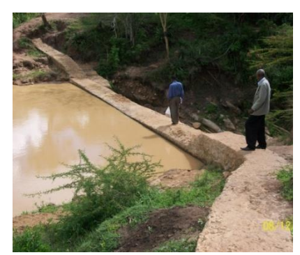
Figure 2: Matiani sand dam

The Matiani Sand dam; which was built in September 2011 funded by Water Services Trust Fund (WSTF). It has a capacity of about 120 m<sup>3</sup> and about 150 beneficiaries who use the water for domestic use, livestock and construction purposes and small scale irrigation. Occasionally, the sand in the dam is sold for construction purposes to commercial dealers at about Ksh. 5,000 per seven (7) tonnes lorry.